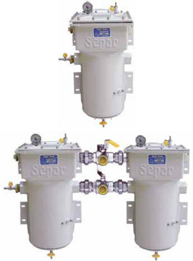
Shown: top 2000/130MK-G bottom 2000/130UMK-G