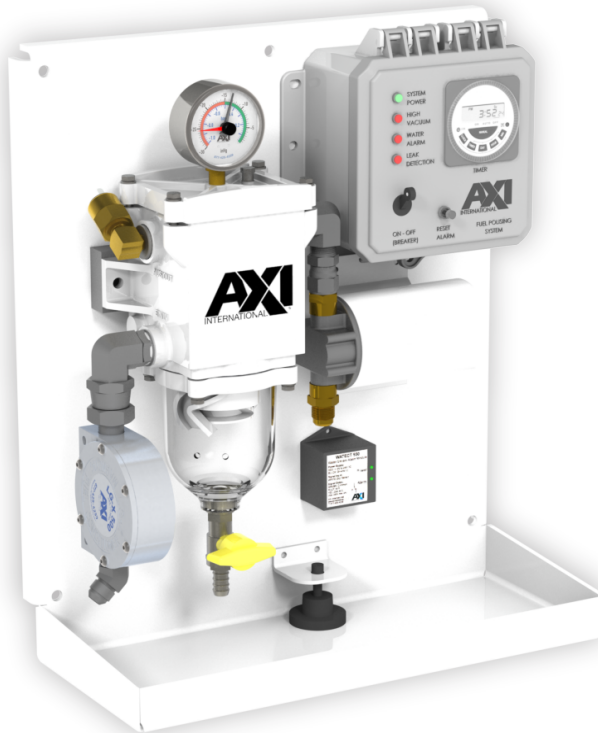
FPS FX with standard-issue Smart Filtration Controller

The FPS FX is a programmable, fully automated, fuel maintenance system that removes water, sludge, and other contaminants from fuel storage tanks. Once installed, the FPS FX system operates independently to ensure fuel reliability through routine fuel filtration. The system's fuel polishing process stabilizes diesel and bio-fuels, eliminating microbial contamination and ensuring the fuel remains clean. These compact fuel maintenance systems are specifically designed for permanent installations indoors, as well as confined spaces, such as inside gen-set enclosures or engine rooms.